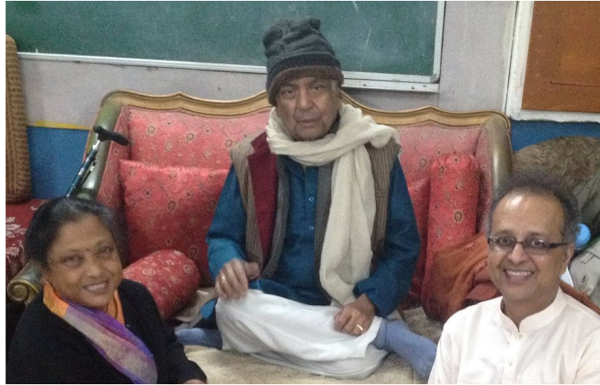
With my Gurus—